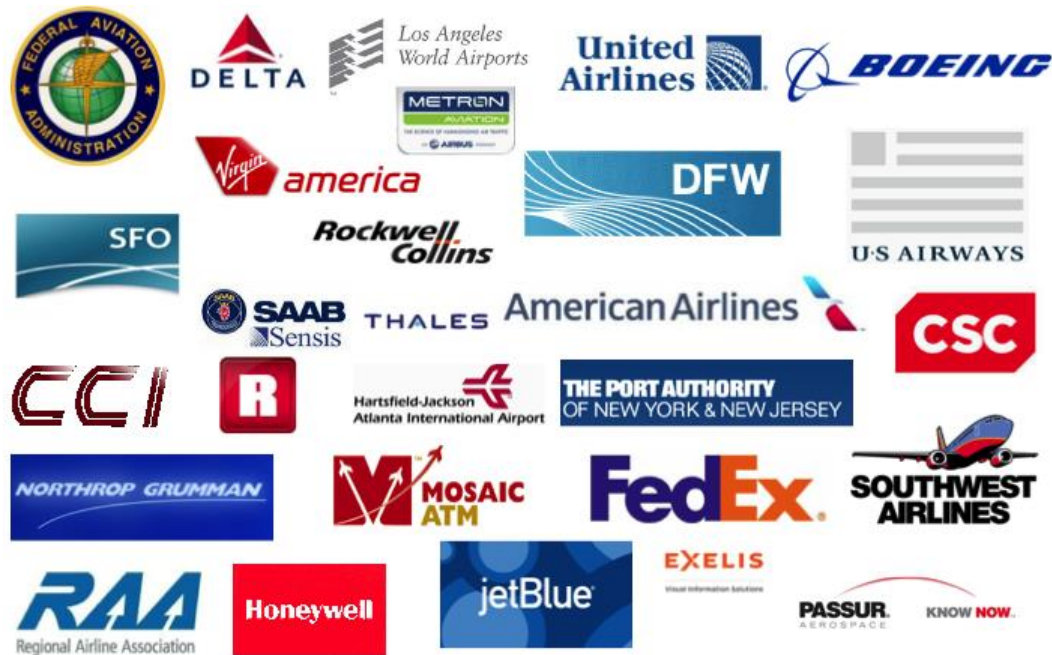
Figure 3. Stakeholders surveyed.

The primary goal of the survey was to uncover all the key issues faced by stakeholders in IADS operations – thus, emphasis was placed on the breadth of understanding of the issues as opposed to depth on specific operational issues. Also, an understanding of the economic and operational impact of any issue to a stakeholder was critical, therefore, particular emphasis was placed on identifying sources with knowledge of operational and business/financial aspects of their companies or organizations. Figure 3 shows the companies and organizations that provided information for the stakeholder survey. They included major US commercial passenger and cargo carriers; airport authorities of major US airports; groups within the FAA with responsibility for surface and terminal operations, operational infrastructure planning, and NextGen implementation; and industry providers of aircraft, avionics, and software/hardware tools that support airport surface and terminal area traffic management.